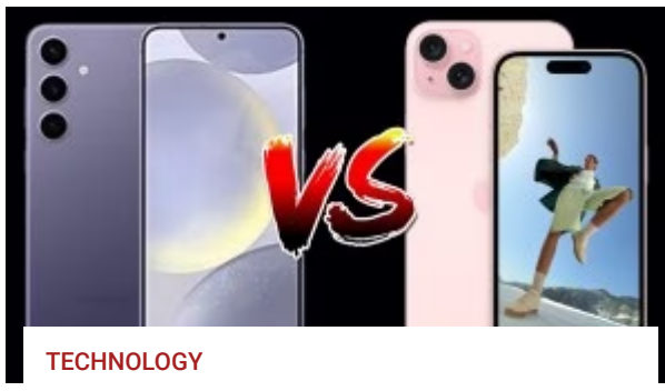
Samsung Galaxy S24+ vs Apple iPhone 15 Plus