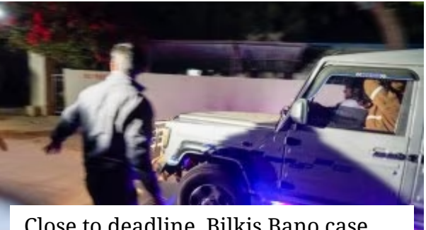
Close to deadline, Bilkis Bano case convicts surrender, reach Godhra jail