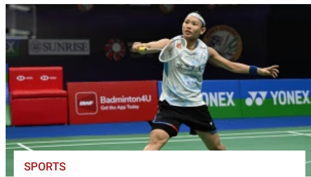
India Open Super 750: The artistry of Tai Tzu Ying, badminton's Sorcerer Supreme