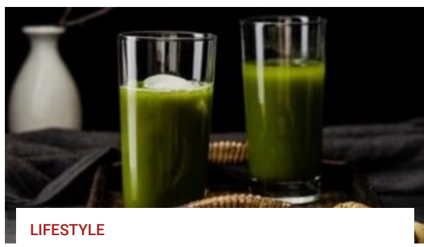
Why moringa or drumstick water is a superfood